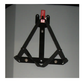
Any guesses on what this new required device is ??