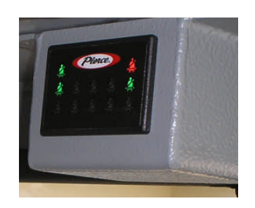
Seat Belt Monitoring System

Our FY09 structural pumpers are ready to start delivery. The first 13 units will be delivered in Dec/Jan time frame and are scheduled for delivery to: Pearl Harbor (2), Jacksonville, Kingsville, Mayport, Carderock, Bethesda, Washington Navy Yard, Indian Head, Sigonella, Norfolk, Portsmouth, and Newport.