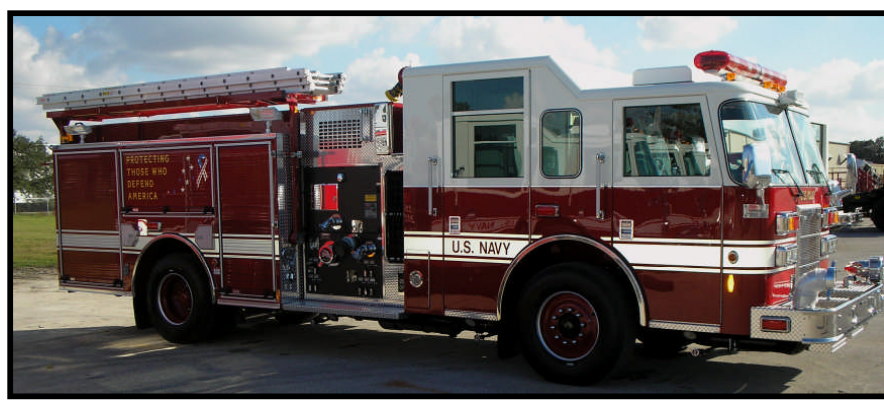
The remainder of the structural pumper order will be delivered in Feb/Mar timeframe and they are scheduled to be delivered to: New London, Earle, Crane (2), Northwest Region (2), San Diego (3), Ventura, Pensacola (2), Patuxent River, JR Marianas (2), and Chinhae.